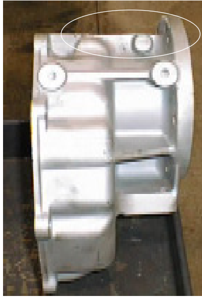
Modified to fit the transfer case shifter linkage