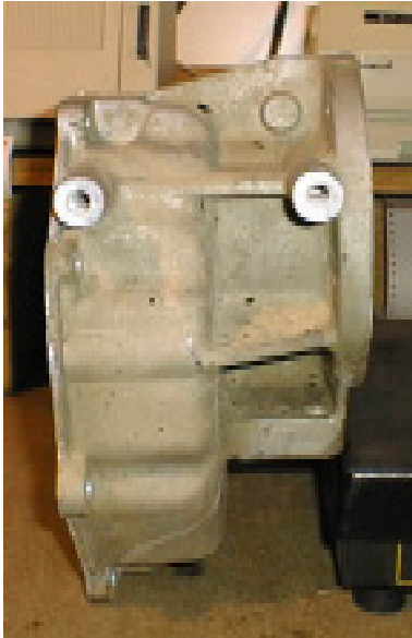
Stock Dodge Adapter