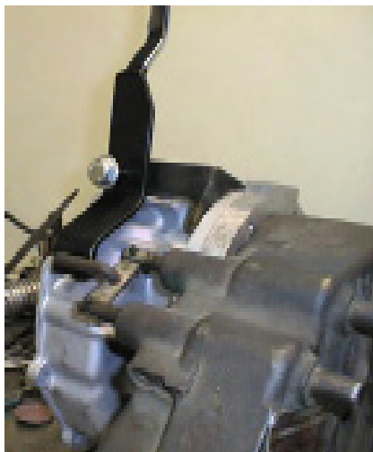
"T" handle linkage installed