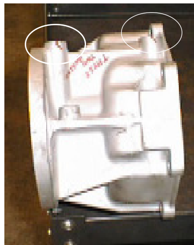
Cut off the stock Dodge shifter bosses

Hardware for the "T" style shifter has not been supplied due to the various different styles of after-market shift handles available.